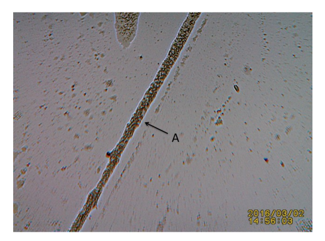
Figure 2 . SDW Microphotograph of replicated in vivo hair shaft outline. Since a paramagnetic solution was used (Potassium Ferricyanide), please notice the homogeneity observed between crystals containing iron particles. This is attributed to the fact that in a paramagnetic, environment there are attractive EMFs. X10 magnification.

Figure 1. Collage of sequential video images showing the replicated hair shaft outline created by EMFs from an in vivo human hair penetrating a glass barrier. This collage image of SDW consisting of two slides coverslips (25x50x0.13 mm) and interstitial PBS Fe2 2K that was secured over author's forearm and undisturbed for 4 hours. Arrows denote partial hair shaft outline seen gradually increasing in diameter towards the mid-section. X4 Magnification.