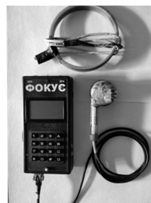
Fig. 1. Apparatus for electromagnetic bioresonance therapy of infectious inflammatory diseases

The problem is solved in that in the method of electromagnetic bioresonance therapy of infectious inflammatory diseases, based on a preliminary analysis of the type of pathogen, determining the calculated range of natural frequencies and the amplitude of the electromagnetic waves of the pathogen and